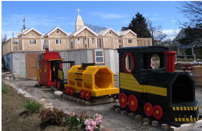
A miniature-village and a colourful wooden train, just the right size for tiny tots to play in, are just some of the components of the new year-round family outdoor fitness park in Meteghan.