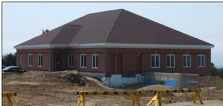
The new Clare Health Centre built next to the recently demolished Medical Centre located on Highway 1 in Meteghan Centre is 14,000 square feet of space for a team of medical professionals housed under one roof.

The lower level, another 7,000 square feet, has space for blood collection services with an adjoining waiting area, offices for Public Health services, Community Health Board, Addictions Services, a class room and board room. To access the blood collection services and other services on the lower level, please park & enter at the rear of the building.